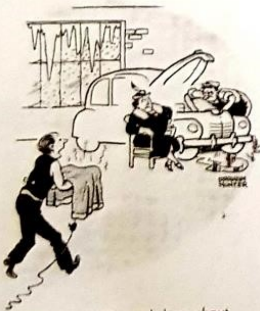
"If you MUST watch how about an electric blanket?"