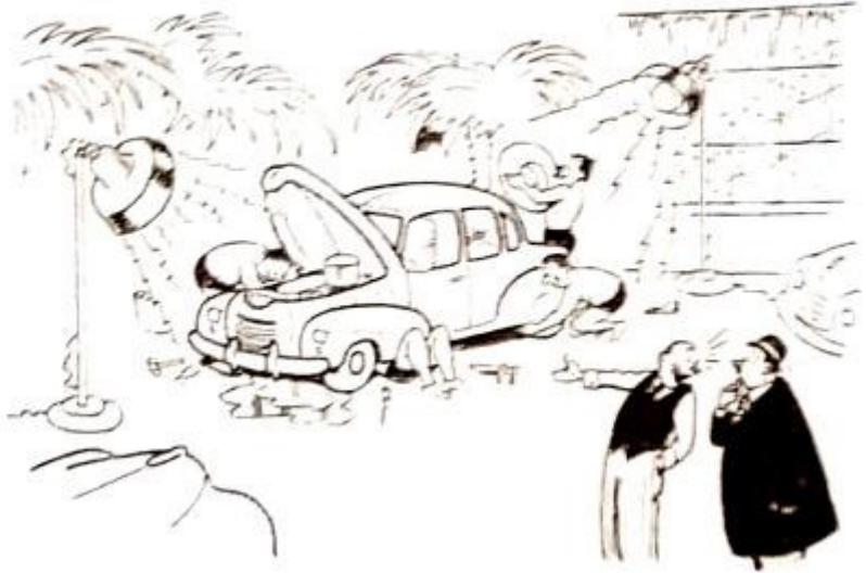
"I promised them a touch of Florida this winter"