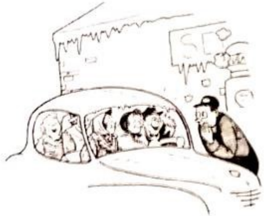
"Heater? Don't need any"