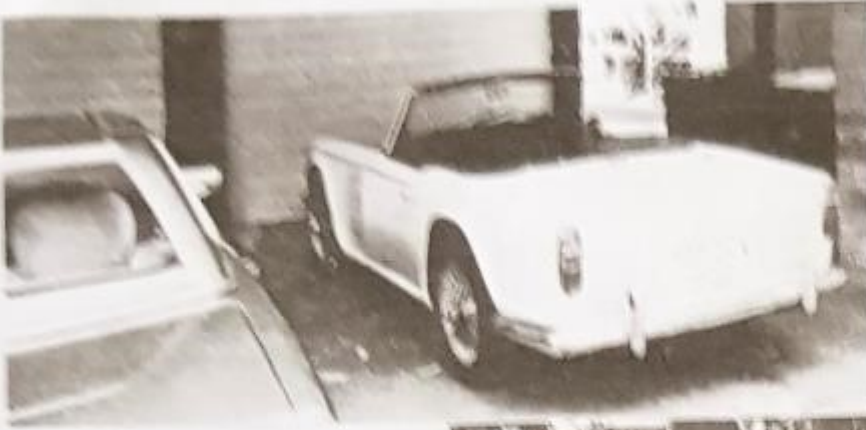
Some of Mike's Current and former cars.