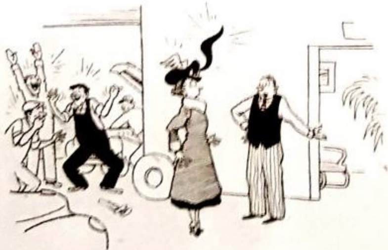
"Do you and your hat mind waiting in the other room?"