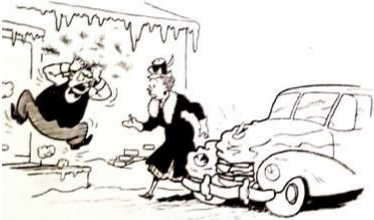
"But aren't you glad it was just a little tree and not the stone wall?"